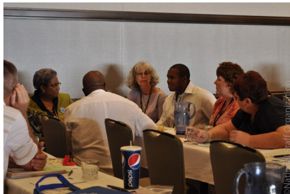
RA delegates debate new business items.

An important new business item was tabled to be brought before the 2012 RA. A proposed change to the Constitution to establish an additional Executive Committee seat for an active NSO Retired member sparked debate. Since many retirees are working on behalf of NSO doing arbitrations, processing ULPs, providing on-site bargaining and/or crisis assistance, and serving as advocates for members, it was recommended that such a position be created to give retirees a greater voice in the organization. Questions regarding the cost of adding another Executive Committee position and the extent of the position's power were raised and need further research.